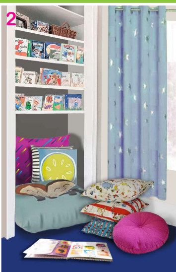
2. LEFT: Empty out a cupboard, add extra shelving between existing shelves and remove the lower shelves to create a cosy hide-out for little readers.