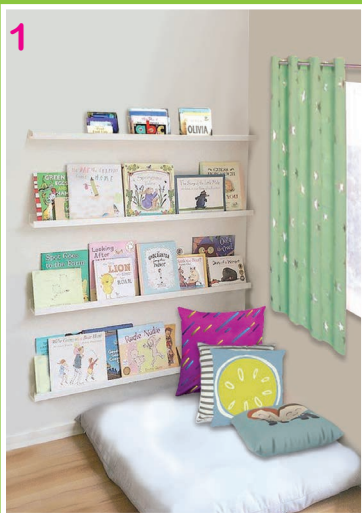
1. ABOVE: A large cushion or bean bag next to a book shelf will do the trick.

Creating a cool space where your child can just hang out will make reading time so much more fun! You don't have to spend big bucks to do it either. Just find (or create) an empty corner somewhere in the house and let your imagination run wild. We have put some ideas together below to stimulate your creative juices.